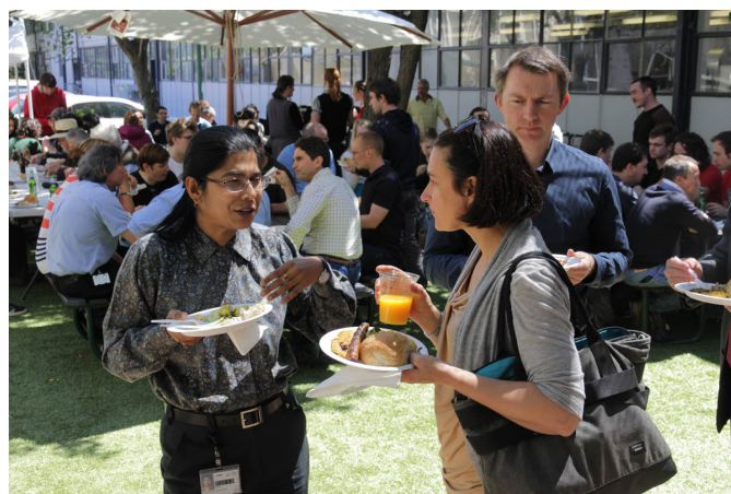
The weather was glorious ensuring that everyone had a great time