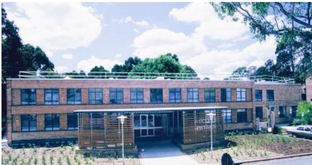
The newly refurbished Nuclear Physics building

Despite the increasing difficulties due to funding constraints, the School has once again distinguished itself and made an increasing number of outstanding contributions to the advancement of knowledge in the physical sciences and engineering. The School can enter the new century with growing confidence. I congratulate all staff and students on the efforts they have made. The results of those efforts, summarised in this report, speak for themselves.